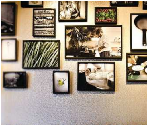
CULTURAL ALLURE Clockwise from top left: Breakfast, brunch, lunch and dinner are available at Fierro Hotel's HG Restaurant, served in a classic dining setting; Cementerio de la Recoleta provides a peek into the city's rich history; Executive Chef Hernán Gipponi serves up fresh, vibrant dishes with locally inspired flavors at HG Restaurant.