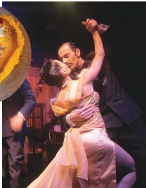
SOUTH AMERICAN FLAIR Clockwise from top: The Faena Hotel invites guests with a chic vibe; a couple performs the Argentinean-born tango; a dish of colorful vegetables and lentils at Fierro Hotel's HG Restaurant.