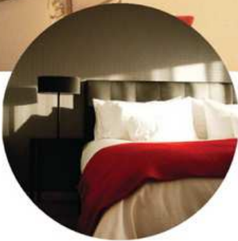
LATIN LUXURY From top: The Philippe Starck designed El Bistrot at Faena Hotel+Universe is a popular choice for its steak, all-white decor and the delicious blend of South American and European flavors on its menu; each of the 27 suites at Fierro Hotel come with all the ideal amenities, from free Wi-Fi to Nespresso machines.

...CONTINUED to receive both a history lesson and political opinion, as the city is still divided over her controversial life and death.