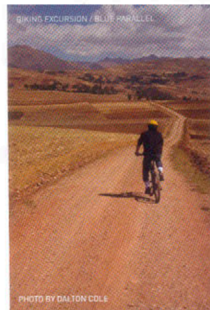
BIKING EXCURSION / BLUE PARALLEL