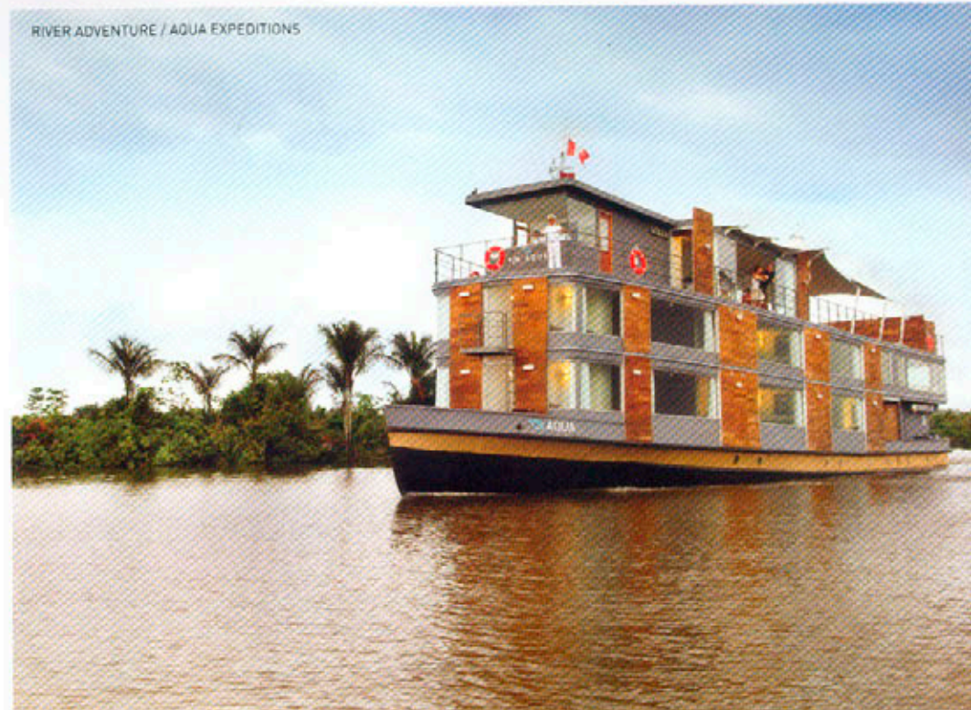
RIVER ADVENTURE / AQUA EXPEDITIONS