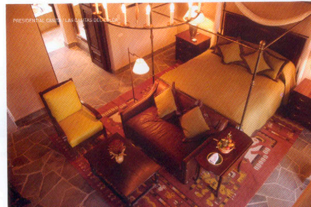
PRESIDENTIAL CASITA / LAS CASITAS DEL COLCA